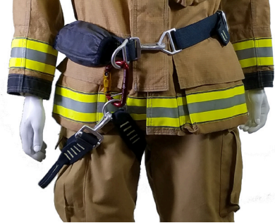
MUS used as a one-legged harness

Accessory pouches allow stowage of the Multi-Use-Strap as well as a multitude of firefighter accessories such as tethers, gloves, etc.