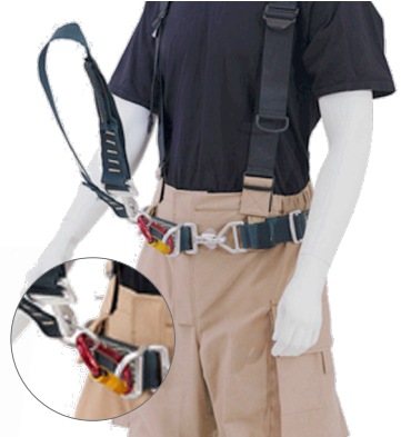
MUS used as a Ladder strap