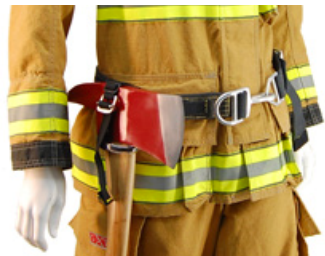
Axe/Tool Holder: 1101-0075

The Leather Scabbard is available for left or right side mount, half or full scabbard, 45 or 90 degree rake angle. (shown here is a right, full, 45 configuration)