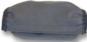
Accessory Pouch: 1101-0080

Accessory pouches allow stowage of the Multi-Use-Strap as well as a multitude of firefighter accessories such as tethers, gloves, etc.