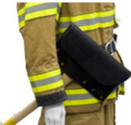
Half Scabbard: 1105-0024

Use caution when donning/doffing your belt with a tool in the Axe/Tool Holder. Tool may fall and cause serious injury.