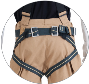
Gross adjustment of the harness is done in the back and neatly put away.

The Apache harness is available in two multi-sized options. Regular fits 28" to 42", large fits up to 54" waists.