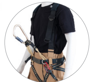
Optional NFPA Ladder Hook Item: 1109-2704