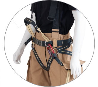
When deployed, the harness A-frame raises and leg straps automatically tightens