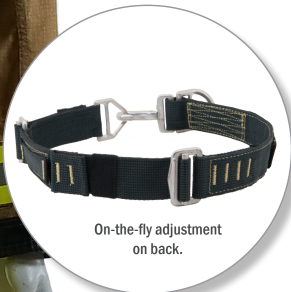
On-the-fly adjustment on back.